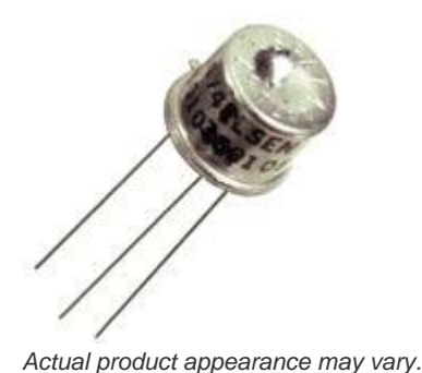
3601 Series TO-5 Thermal Switches